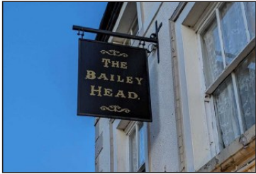
■ The Bailey Head.

WHEN my editor said: "I have a job for you, I want you to pop to Oswestry's multi award winning pub and see what makes them so good", I have to admit it didn't require a huge amount of arm wrenching.