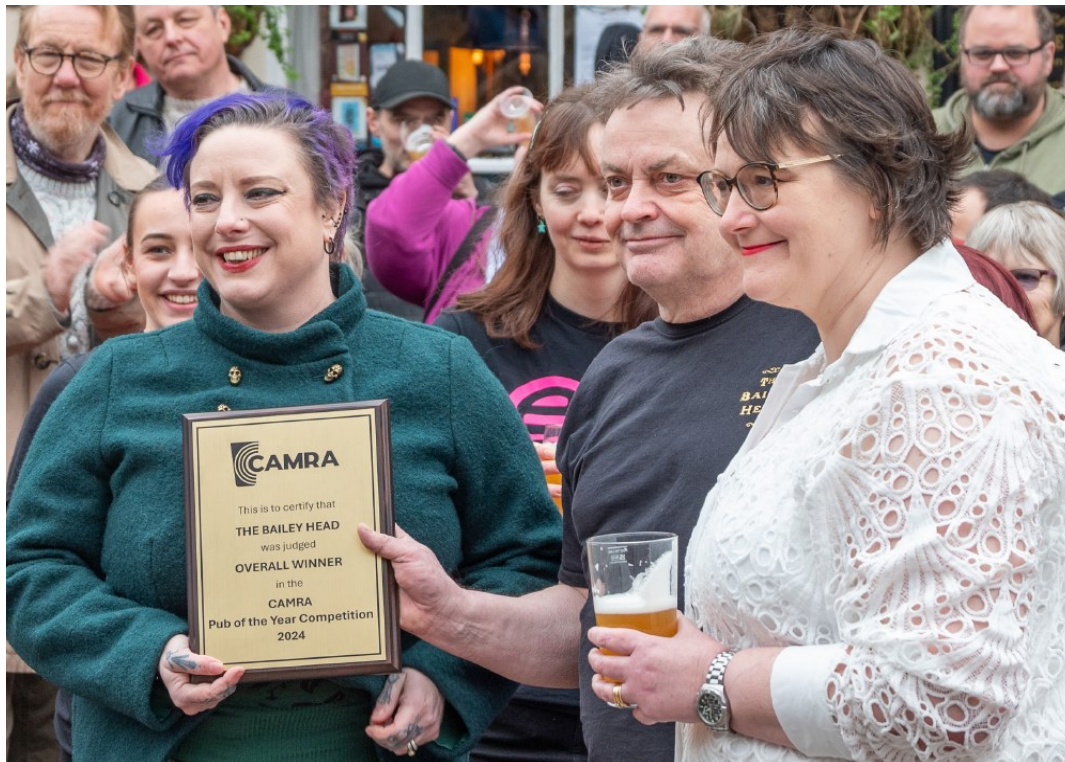
■ The Bailey Head in Oswestry celebrates being named the best pub in Britain by CAMRA.