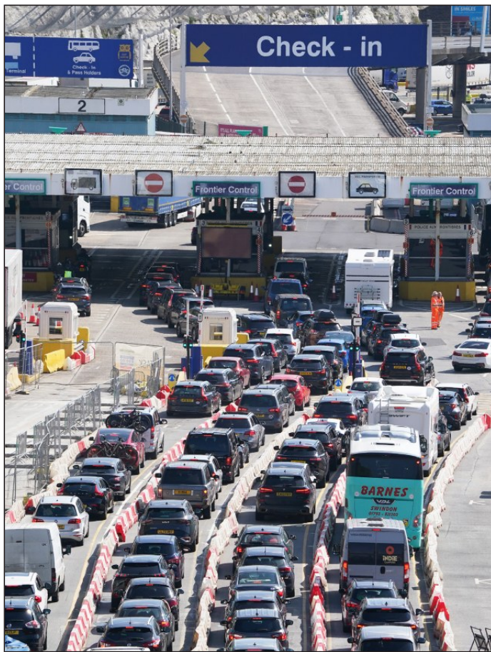
■ Traffic at the Port of Dover.